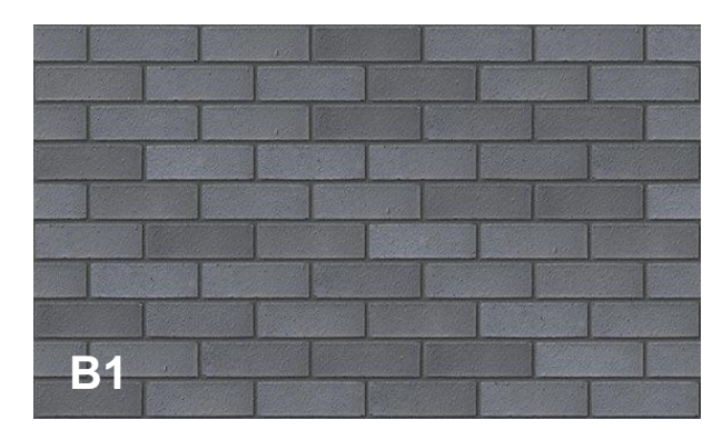
BLACK BRICK AND MORTAR